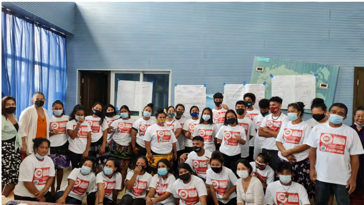
Transforming Education Youth Summit, Federated States of Micronesia August 2022

"The voice of the youth holds the power of change."